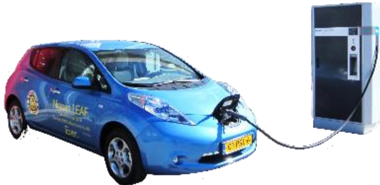
Fast charging products